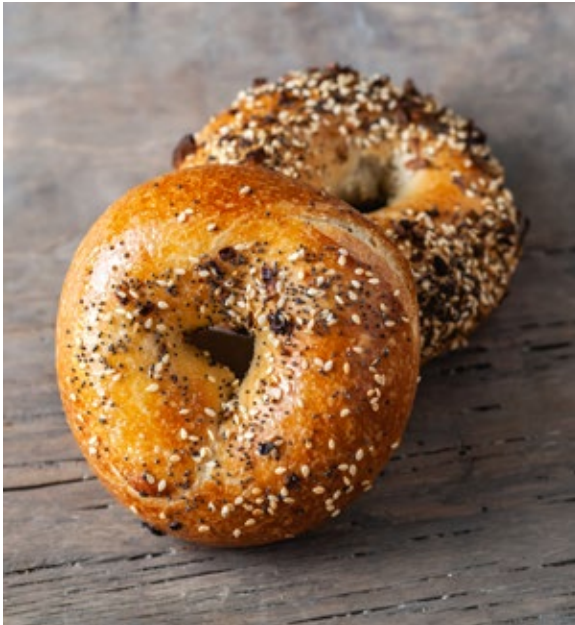
Everything Bagel #1016