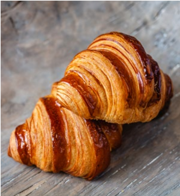
Butter Croissant #2000