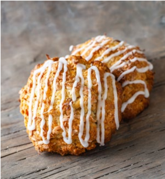
Coconut Scone #2023

Select mini sized scones available upon request.