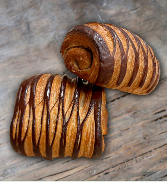
Chocolate Croissant #2003