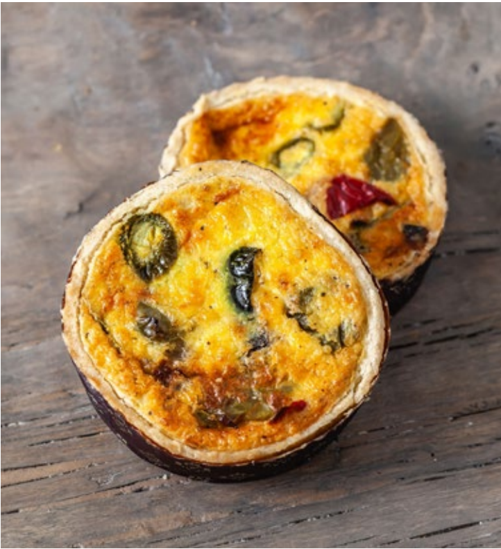
Jalapeño Roasted Veggie Quiche (4 in) #5000