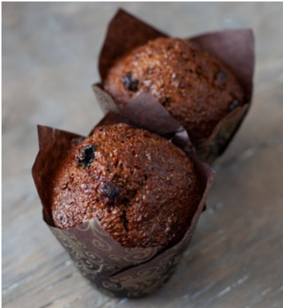
Bran Muffin #2017