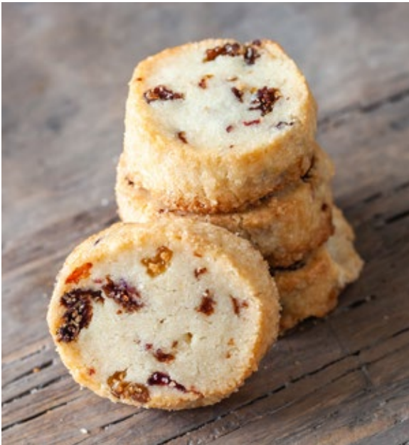
Shortbread Cookies (12pk) #2038