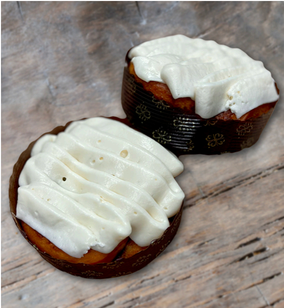
Cinnamon Roll #2400