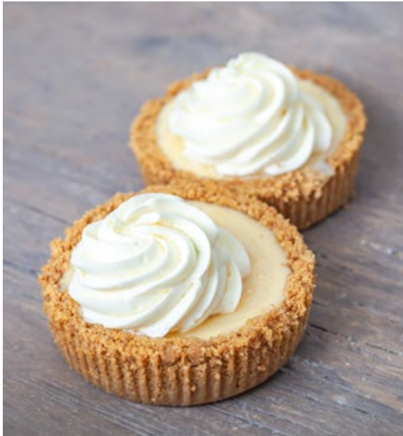
Key Lime Tart - 4 in #3009