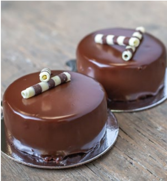
Chocolate Mousse Cake #3031