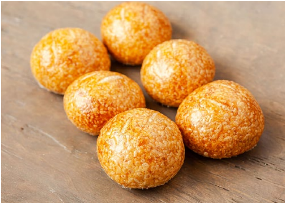
Sourdough Roll (6 pk) #1034 (Seasonal)