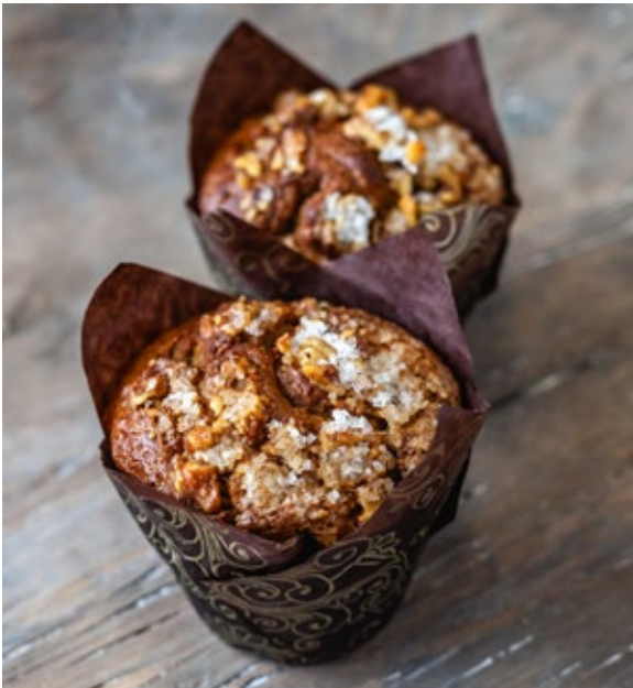
Banana Nut Muffin #2015

Lemon Poppy Seed Muffin #2010 (Seasonal)