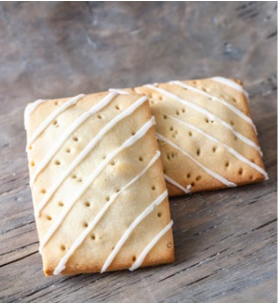
Raspberry Poptart #2087