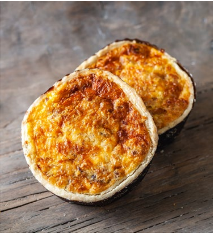
Quiche Lorraine (4 in) #2047