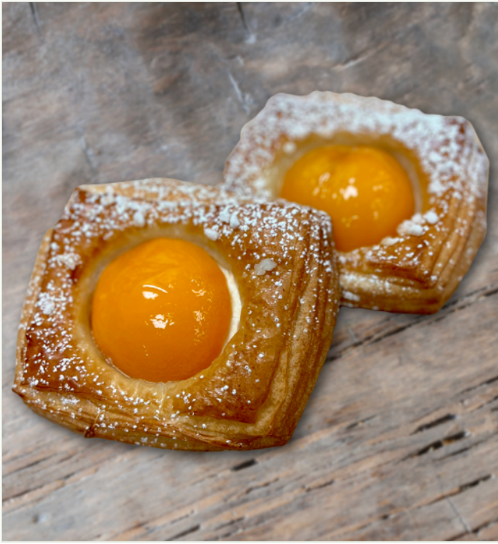
Peaches and Cream Danish #2030 (Seasonal)