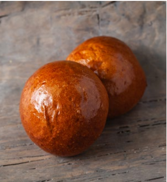
Brioche Burger Buns (6 pk) #1048