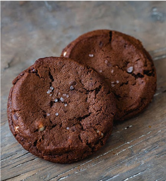
Double Chocolate Cookie #2049