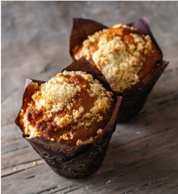
Cranberry Orange Muffin #2011 (Seasonal)