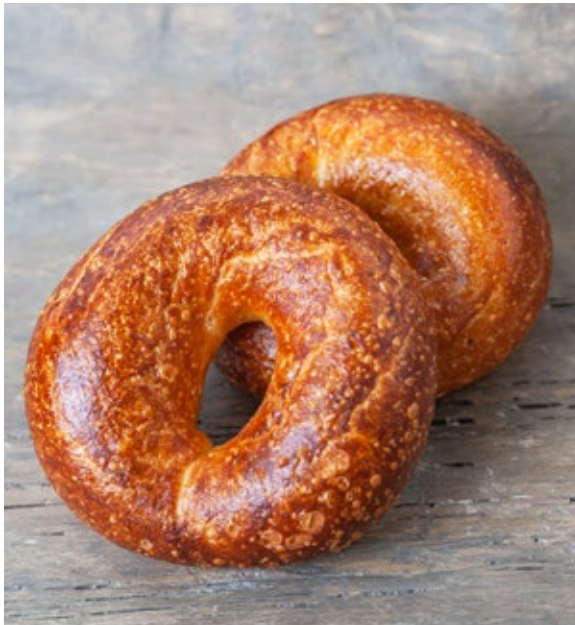
Whole Wheat Bagel #1062