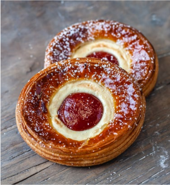
Guava Cheese Danish #2003