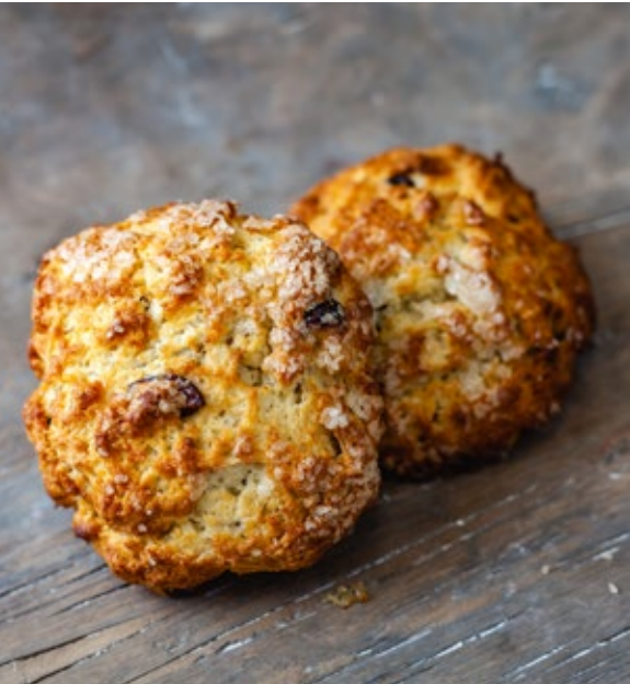
Cranberry Orange Scone #2024