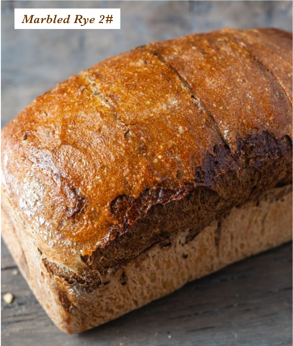
Marbled Rye 3# #1204