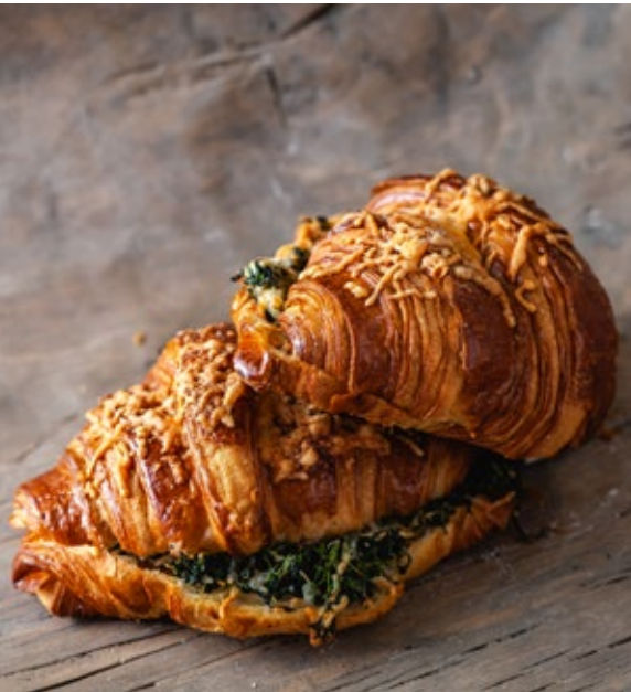
Spinach Cheese #2006