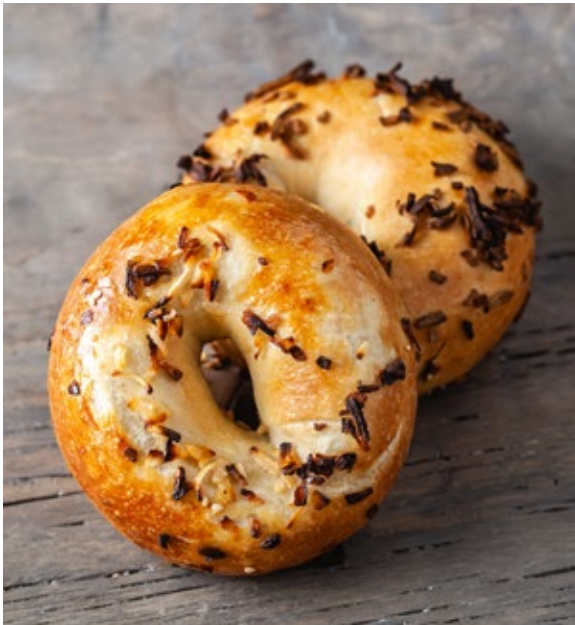
Onion Bagel #1061