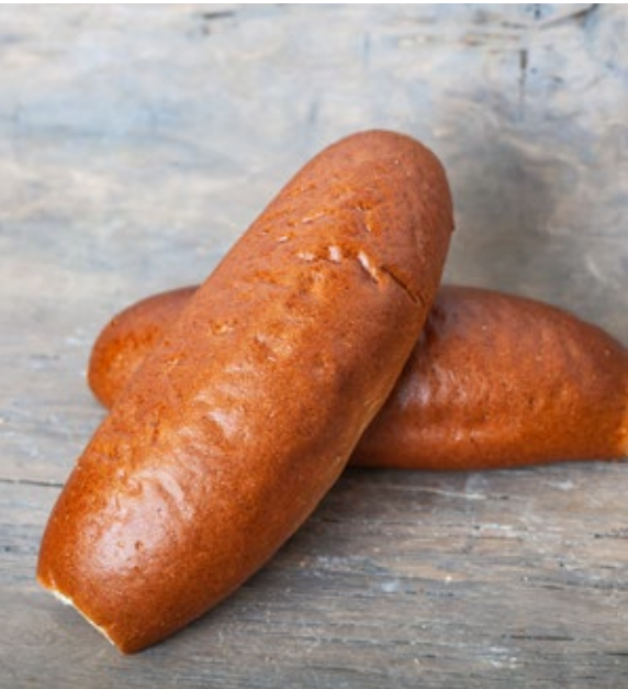
Brioche Hot Dog Bun (6 pk) #1051