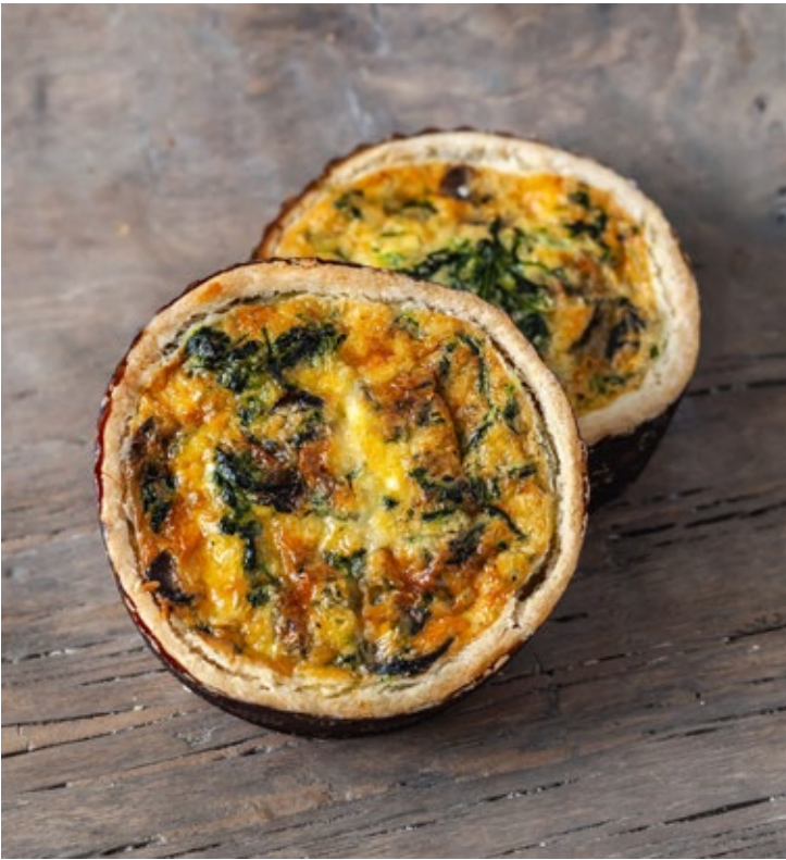
Spinach Mushroom Quiche (4 in) #2048