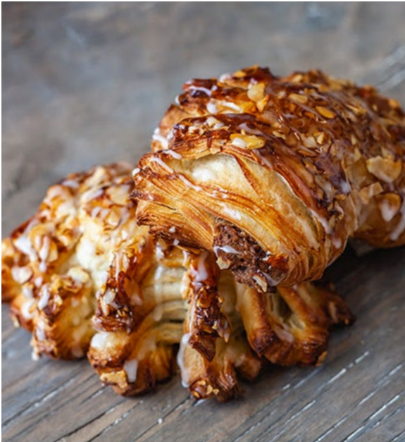
Bear Claw #2007