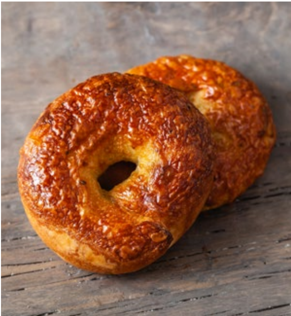
Jalapeño Cheese Bagel #1018