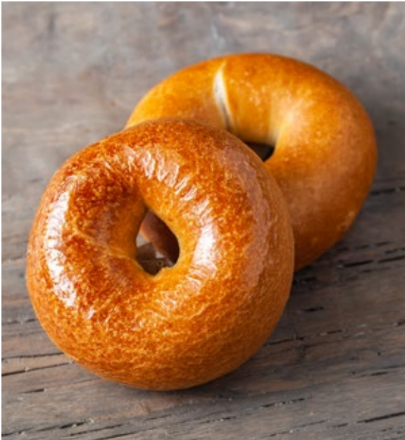
Plain Bagel #1015