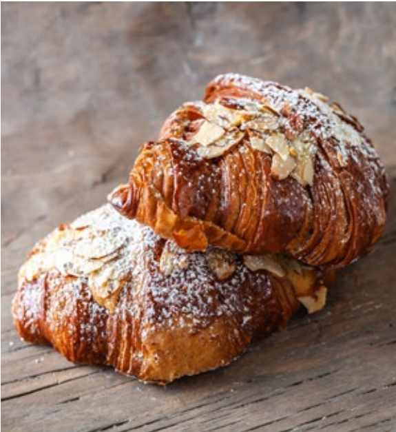
Almond Croissant #2002