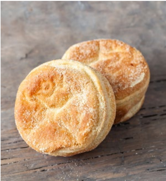
English Muffin (12 pk) #1008