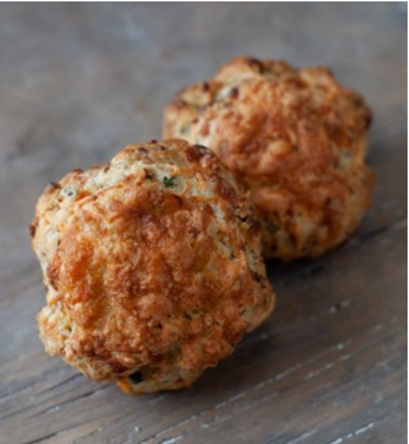
Bacon Cheddar Scone #2026