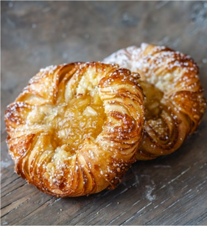
Apple Danish #2142