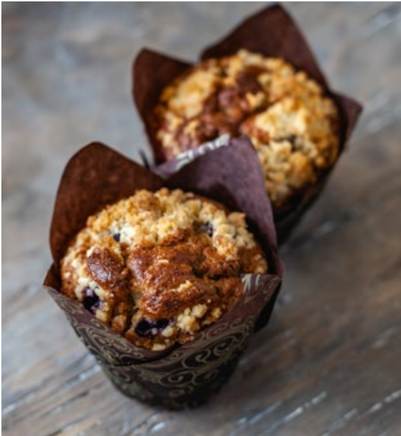
Blueberry Muffin #2009