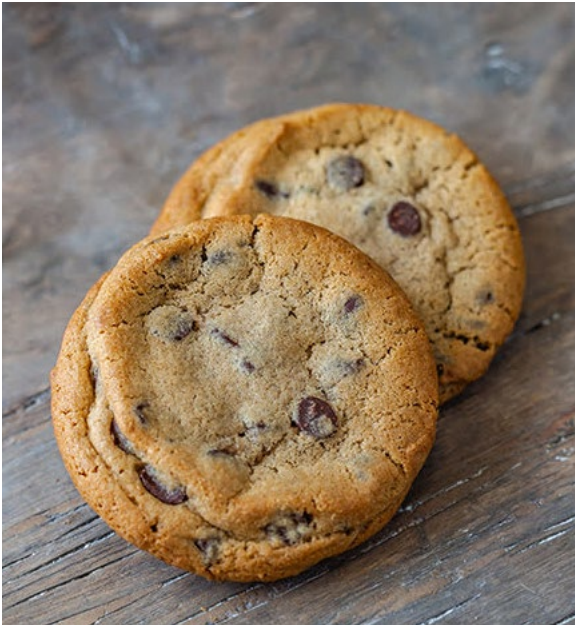
Chocolate Chip Cookie #2028