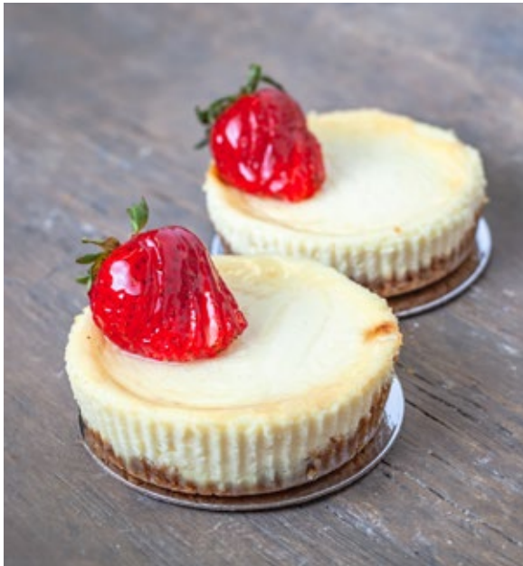
Cheesecake - 4 in #3011 (seasonal)