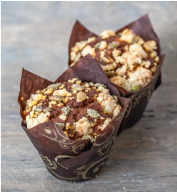
Pumpkin Muffin #2016 (Seasonal)