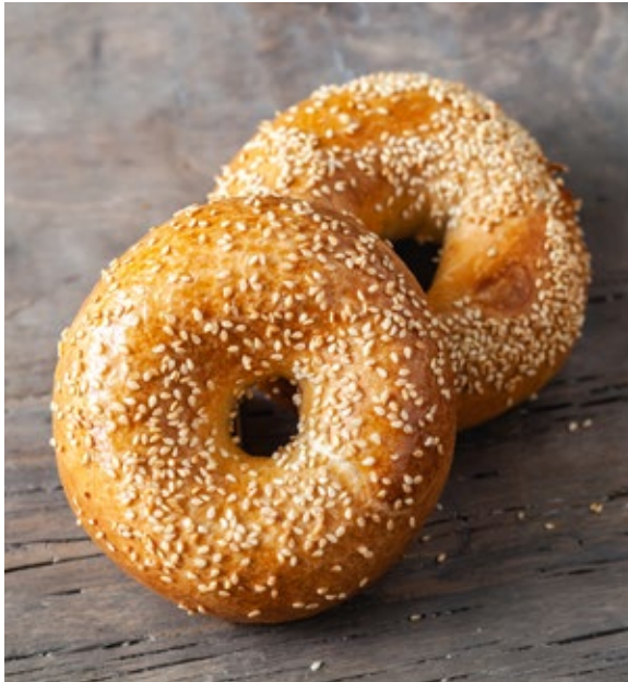
Sesame Bagel #1017