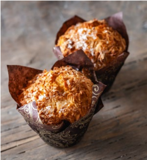
Pineapple Coconut Muffin #2010 (Seasonal)