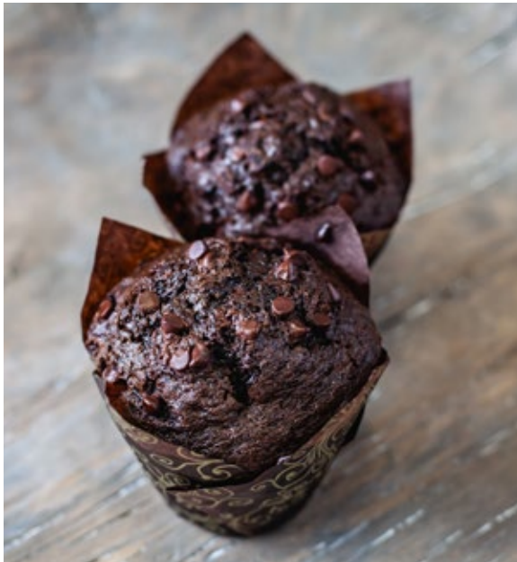
Double Chocolate Muffin #2019