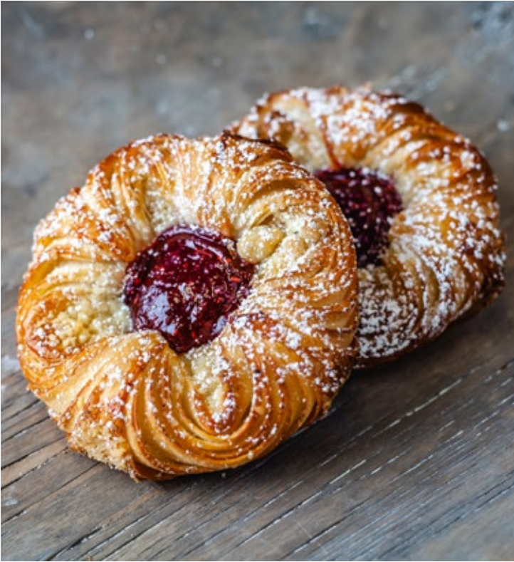
Raspberry Danish #2141