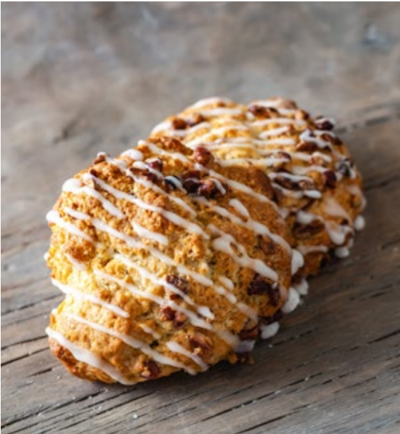
Maple Pecan Scone #2025 (Seasonal)