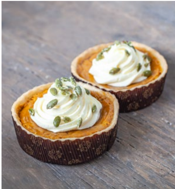
Pumpkin Pie - 4 in #3014 (seasonal)