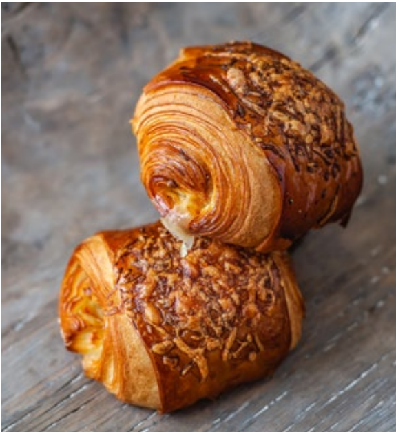
Ham & Cheese #2004