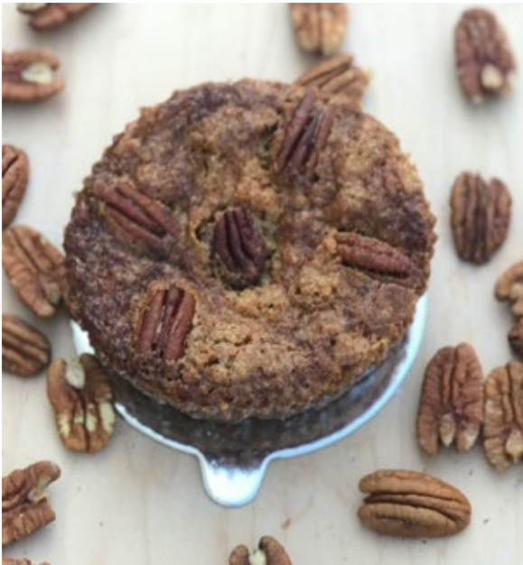
Pecan Tart - 4 in #3010

Chocolate Mousse Heart Cake #3041 (Seasonal - Valentine's Only)