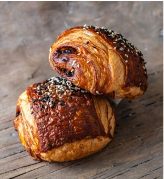
Chocolate Pretzel #2070