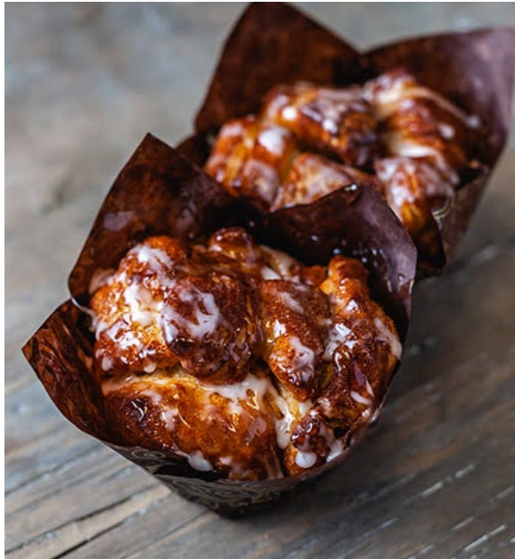
Cinnamon Pull-Apart #2008

Select mini sized pastries available upon request.