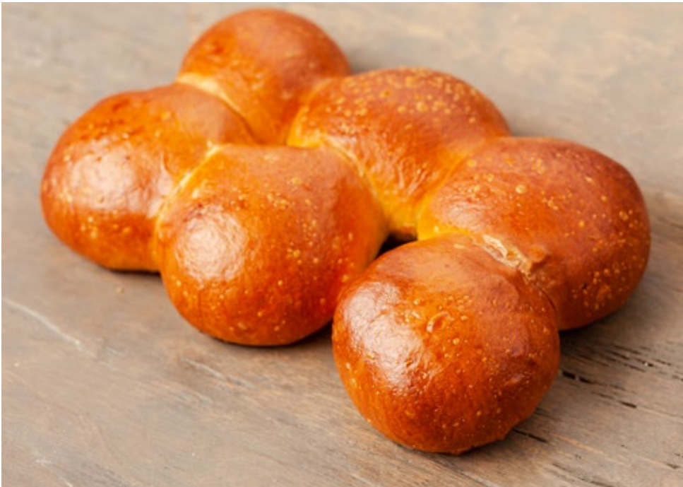
Brioche Dinner Roll (6 pk) #1074 (Seasonal)