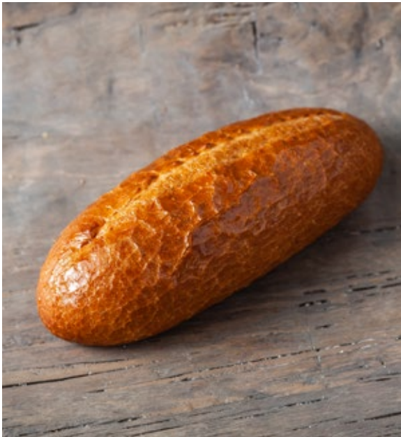
Potato Hot Dog Buns (6 pk) #1067