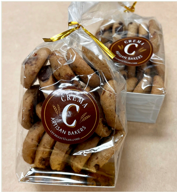
Mini Cookie Bites #2131_2