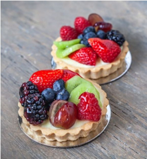
Mixed Fruit Tart - 4 in #3001