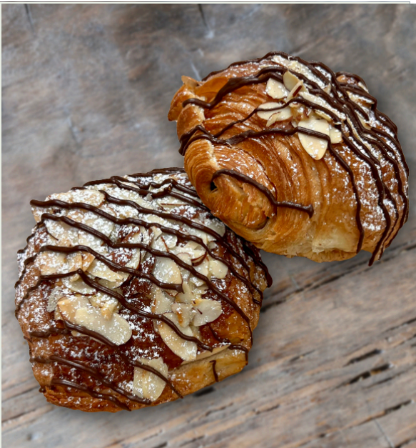
Chocolate Almond Croissant #2001