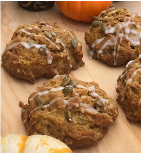
Pumpkin Scone #2119 (Seasonal)