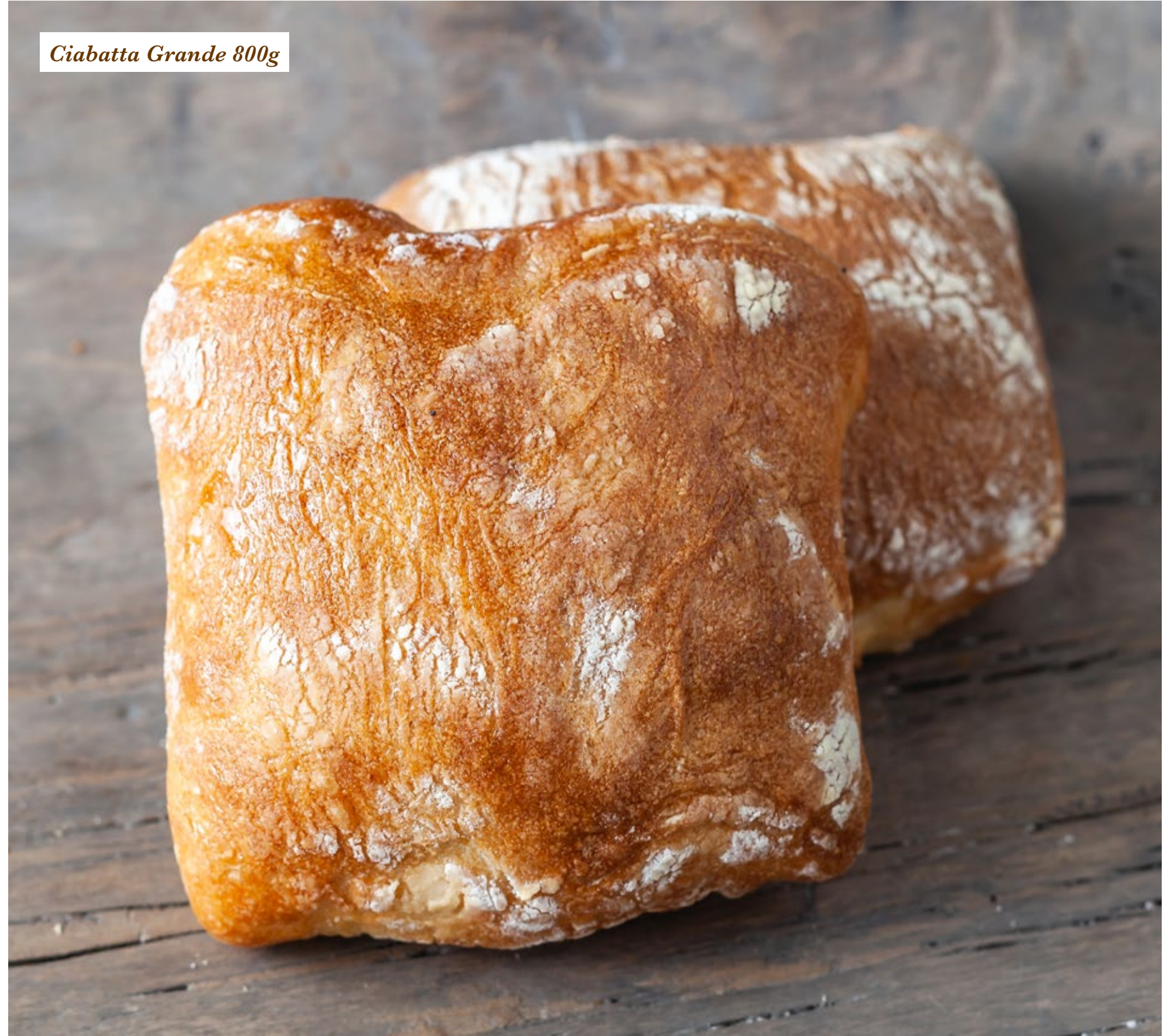
Ciabatta Grande 800g