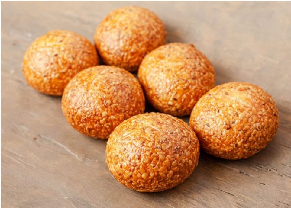
Multigrain Roll (6 pk) #1006 (Seasonal)