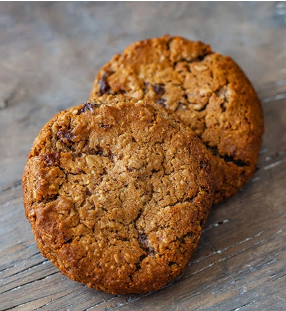
Oatmeal Raisin Cookie #2029