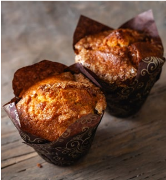
Apple Cinnamon Muffin #2014 (Seasonal)