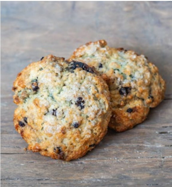
Blueberry Scone #2027