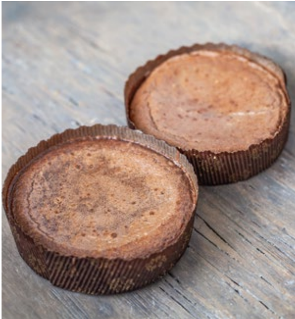
Lava Cake - 4 in #3020