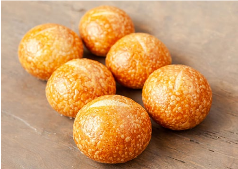
French Roll (6 pk) #1037 (Seasonal)