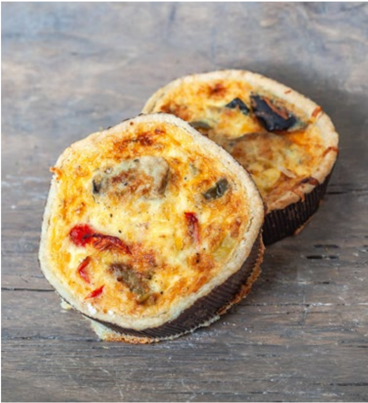
Roasted Vegetable Quiche (4 in) #2046