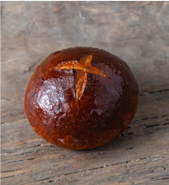
Potato Pretzel Buns (6 pk) #1067